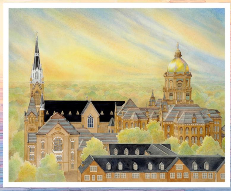
Campus Sunset Published in the international book "The Best of Watercolor- Splash 12, Celebrating Artistic Vision"