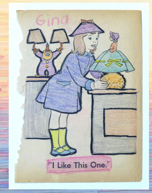
Coloring book picture