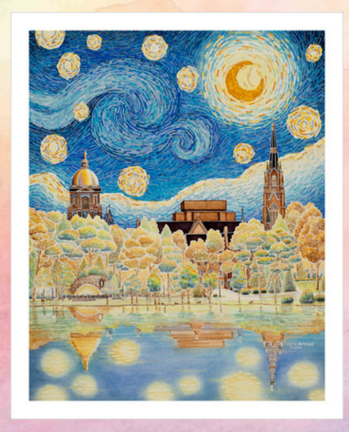
Starry Night over Notre Dame Awarded "Best Overall" in the juried art show at Wellfield Botanic Gardens

Here's a few of my favorite watercolor paintings along with a coloring book page colored with my aunt and sister at my side.